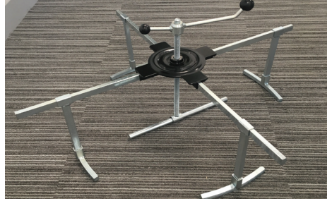
2. Assembled Portable Kit.