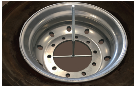
4. For truck tyres, only break the back bead and place the longer T Rod with extension under the front of the wheel.