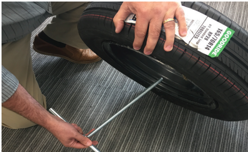
3. For car tyres, only break the front bead and place the T Rod under the back of the wheel.