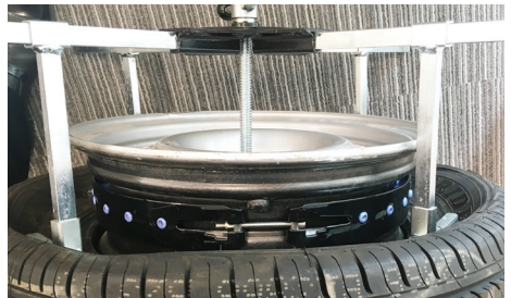
6. Fit the Multiband, making sure the fixing is located at the tyre valve.