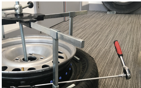
7. Tighten the fixings to 7.5Nm car or 12Nm truck.