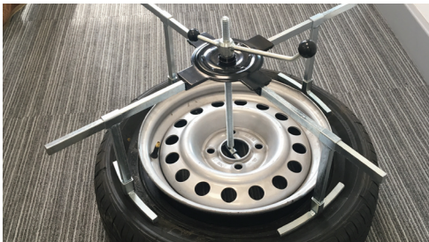
5. Assemble the Portable Frame, adjusting the feet width to suit and wind down the handle compressing the tyre and exposing the Wheel Well.