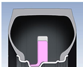
Standard wheel and runflat

For these reasons, Tyron developed the R4 heavy duty alloy wheel with its rather simple but