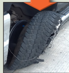
As a deflated tyre collapses, the wheel rim can come into contact with the road causing loss of control