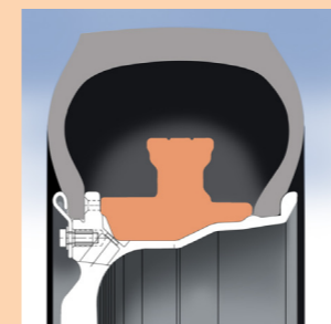
TYRON R4 Wheel and ATR Runflat, with Double Beadlock

In a 'standard' runflat, the design has to allow for the tyres to be re-fitted and therefore no beadlock is possible and so the tyre will effectively "float" on the wheel causing lack of control when running flat. (see above)